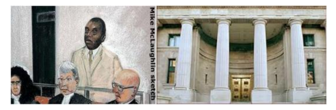
Analyse - Analysis