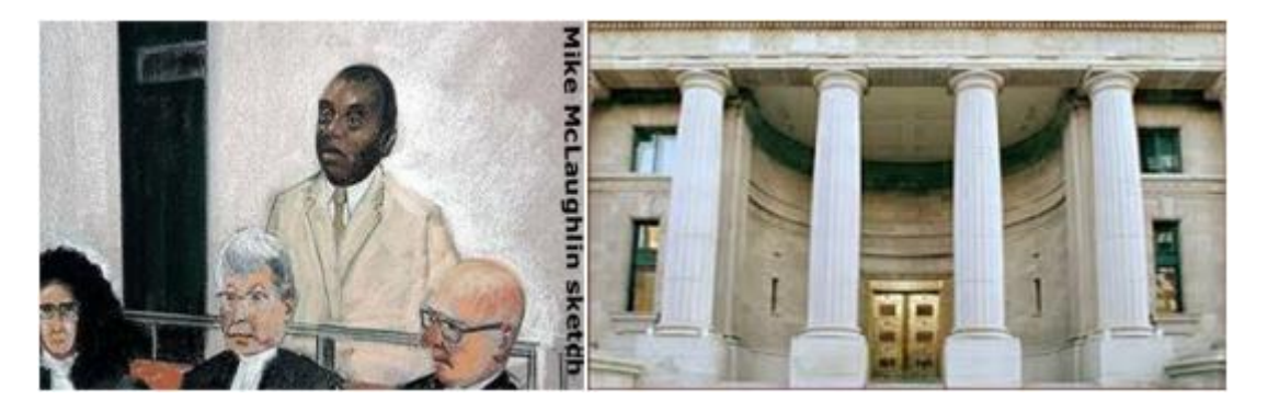
Analyse - Analysis